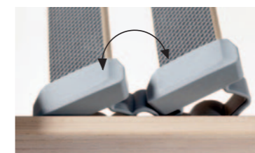
Movable shoulder supports provide optimal body adjustment