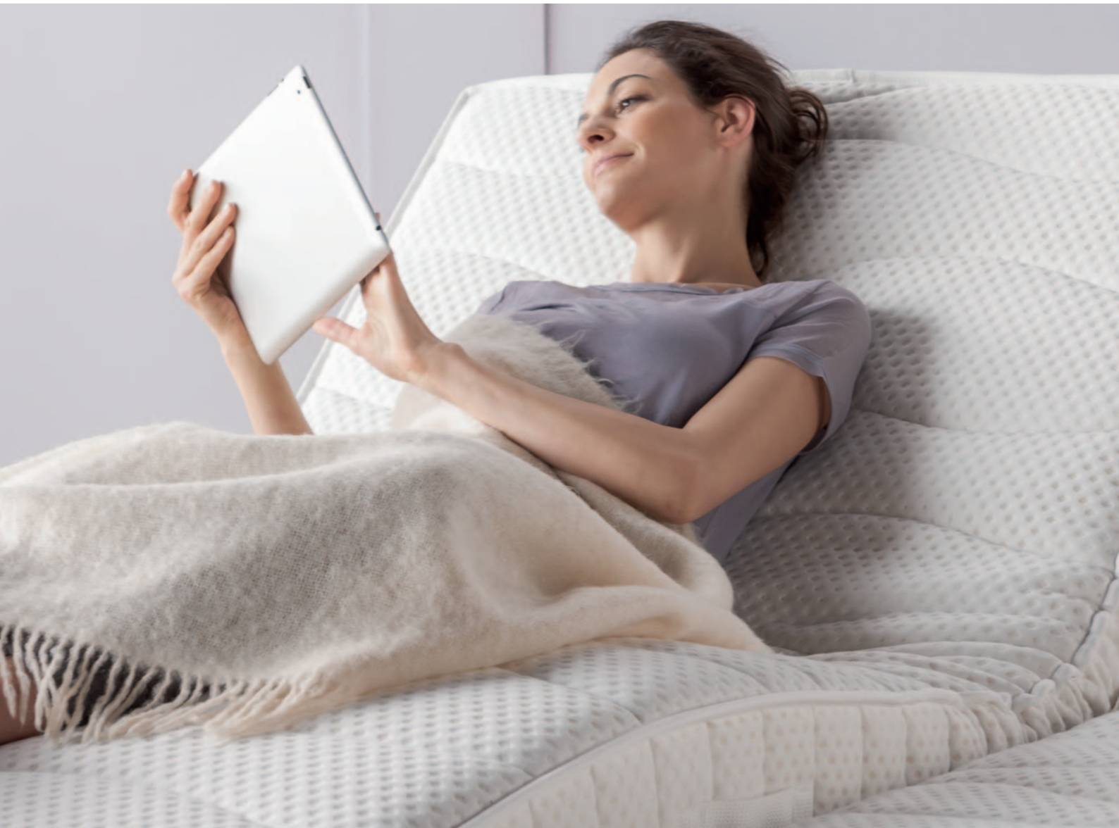
FR 7 Base frame