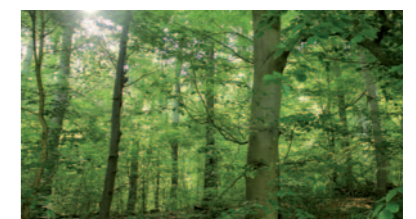
Solid beech wood sourced from native forests and sustainable forestry