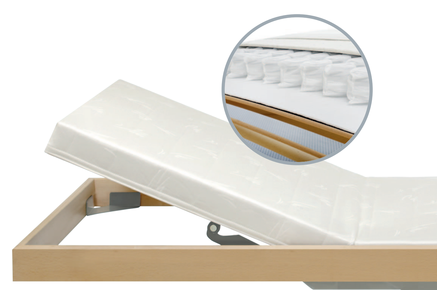
For even more comfort: Selecta UP11 2-Matic

Selecta UP11 is a padded sprung base that is distinguished by its interior double spring system – the barrel pocket spring core and wooden spring slats are perfectly coordinated, and their harmonious interplay, especially when combined with a pocket spring core mattress, results in the so-called "box spring effect". Maximum reclining comfort thanks to a mild undulating sensation. Careful craftsmanship and selected materials, such as high-quality solid beech wood, make Selecta UP11 exceptionally sturdy and durable.